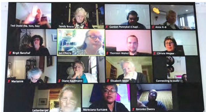
The Executive Committee of the DIAKONIA World Federation, in July, 2020.

dotac.diakonia-world.org diakonia-world.org