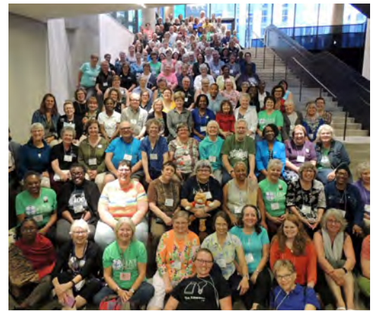
DOTAC's August 2019 gathering in Vancouver.

As President of DOTAC, I sit on the Executive Committee of the DIAKONIA World Federation and for four days in July, we met via Zoom. We were supposed to be meeting in Frankfurt, but that, of course, got cancelled. The technology that allows this to happen